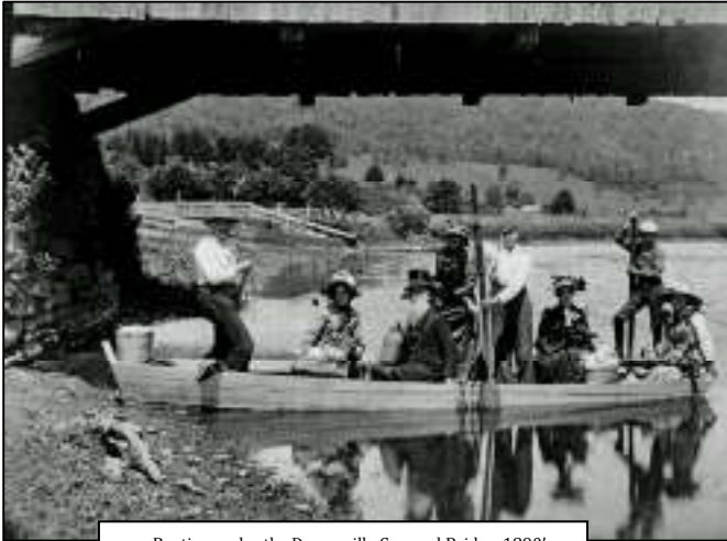
Boating under the Downsville Covered Bridge, 1890's