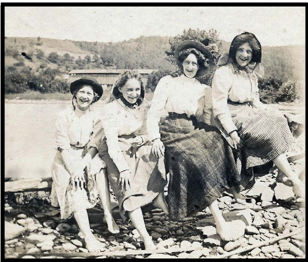
Early Bathers 1890's

Views from Under, On and Near the Downsville Covered Bridge will be on display in the Colchester Town Hall from August 1 to September 30 th . This is a fun and interesting mix of photographs from around the Downsville Covered Bridge from the 1890's until the turn of the century. The display will also include photographs of the other covered bridges that used to be in Colchester. The majority of the photographs has not been displayed or published by CHS, so stop by and reminisce about when you took a dip or went fishing under the Covered Bridge when you were a kid.