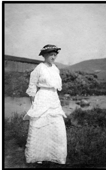
A walk by the bridge 1913