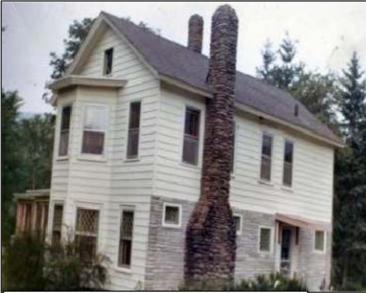
The Chateau after 1950's renovations.

owners of the house. Additional renovations were done in the 1970's and the house changed hands several times through the next thirty years falling into disrepair and finally to foreclosure.