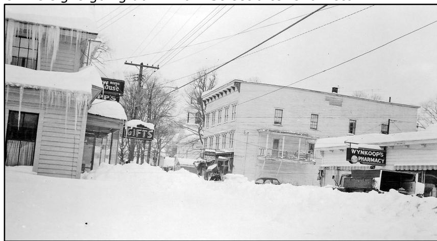
October 1959 snow storm Main St.

Pangburn and Rosebud Gray were Downsville farmers for over fifty years and told of their youthful bobsledding adventures in Colchester. Pang reminisced about bobsledding down Tub Mill Road on an eight foot sled. After a big snowfall and when the snow was packed by the sleighs going into town, the children of the village would head out on the hills to enjoy riding down the local hill roads and the brave would challenge Tub Mill's hill. "You would have the older boys in front and back of the bob with the younger boys and girls packed in the center of the sled. The older boy in the back would push with all his might and the sled would start to fly down Tub Mill as he hopped on. We would all hold on for dear life as we flew down Tub Mill and if we made the turn on to Main Street, and that was a big if, because we usually crashed, but if we made it, boy what a ride we would have! We would speed all the way down Main Street and right up and over the Downsville Covered Bridge and clear to the Brooklyn side of the river. What a thrilling ride!"