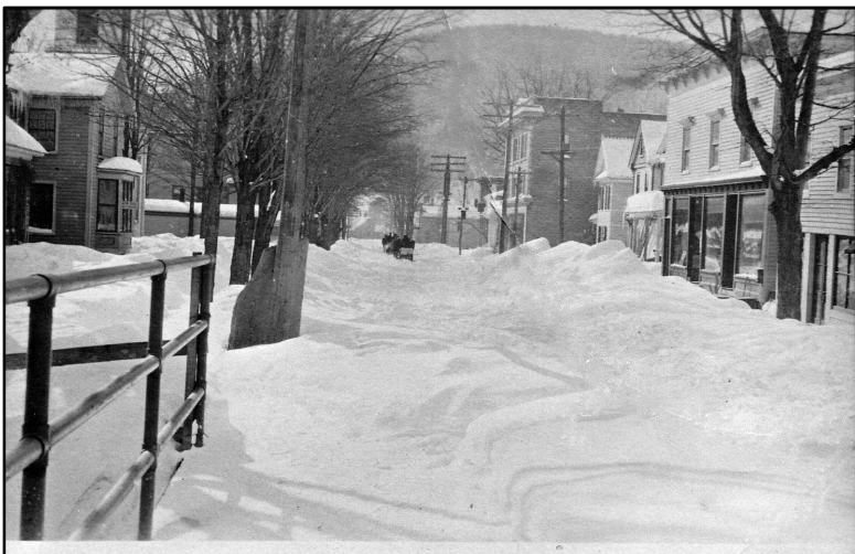
1914 sleighs going down Main Street after snow storm.