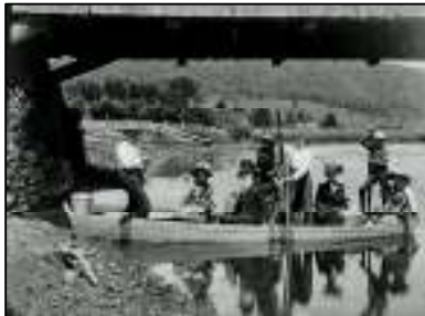
Boating under the Downsville Covered Bridge, 1890's

Colchester Historical Society 2014 Calendar