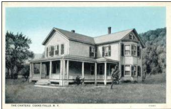
The Chateau postcard circa 1911