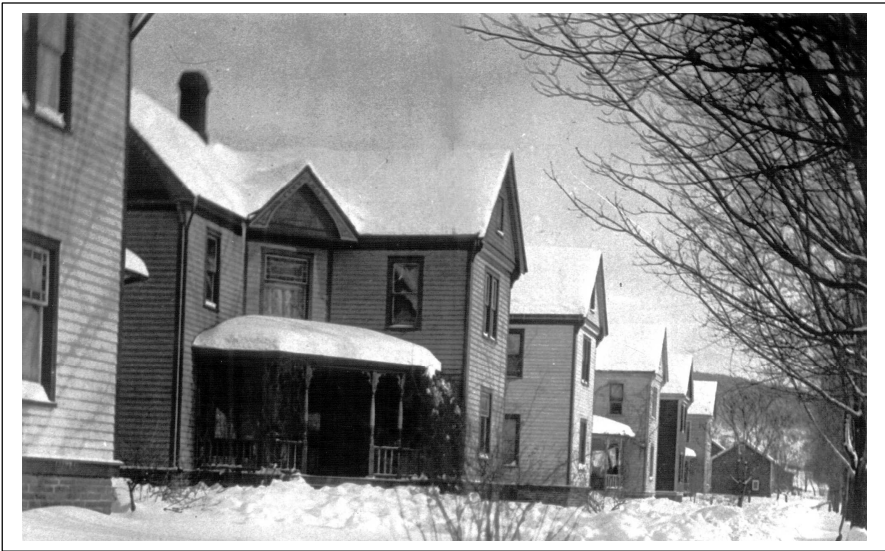
Three different time period photographs for the Downs Homestead on Main Street, Downsville.