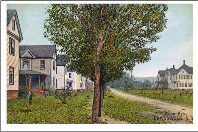
Early postcard view of Knox Avenue houses