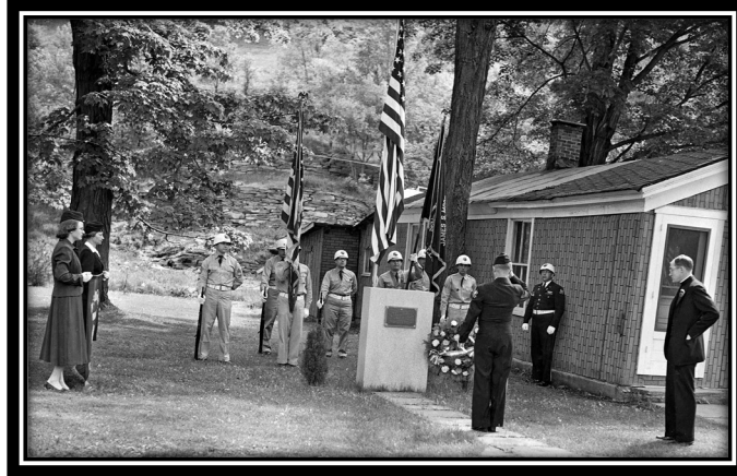
Celebrating 100 years of the James S Moore, Post 167 American Legion

calendar features black and white photographs of Colchester's Civic and Social Clubs and features a special page celebrating the 100 th anniversary of the James S. Moore Post 167 American Legion and a Photo Name Key. Calendars are $15 and available at Colchester Town Hall, The Downsville Diner, and on-line through the Historical Society website. Proceeds from the calendar will be used to conserve the artifacts and documents of the Historical Society and educational programming.