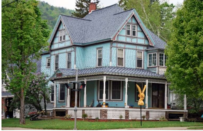
Modern view of LaTourette home on Main Street, Downsville.

Making a physical examination of the building to determine the building techniques, molding profiles, types of glass, types of materials and finishes all give clues to the house's age. Ornamental details, roof lines also help to identify a house's style and help pinpoint a time frame for the building's construction. If the physical evidence does not agree with the documents connected to the building and the tax rolls do not show a building on the site then the building was most likely moved to the site. Some whole or parts of buildings were moved to different locations within the village of Downsville. During the construction of the Pepacton Reservoir some houses were moved from Pepacton to locations within Downsville and the surrounding villages.