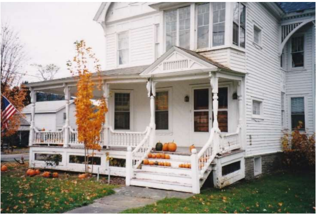
Owned by Archie Campbell