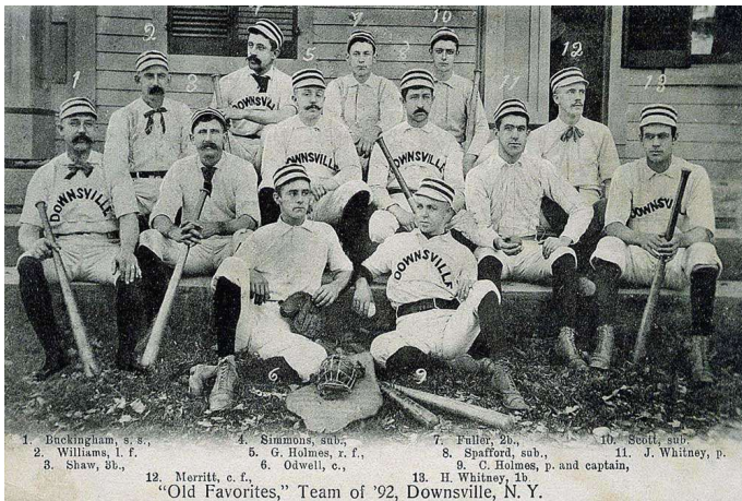
1892 Downsville Baseball Team

Colchester Baseball The earliest photograph the Historical Society has for a town or village team is the 1892 Downsville Team. Colchester village and town teams have existed since the 1870's and spirited rivalries existed. Downsville's team was known as a hard-fighting skilled group. These games were played for a "purse" which was split among the team members. The 1903 Downsville Fair baseball purse was advertised at $50, $35 to winners and $15 to the losers. Teams at that time usually consisted of nine players, but the earliest 1892 team photo from the Historical Society collection has thirteen members plus a manager. The average wage in 1903 was less than $2 per day, so playing baseball for an afternoon would have been an enjoyable way to earn more than a day's wages. These games provided summer entertainment and a chance for the players to earn some extra cash.