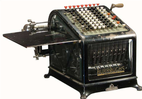
Burroughs Posting Machine

We had two machines, an adding machine and the Burroughs posting machine. All other work was done by pen or pencil. The wood floors were worn and the windows were drafty and the lighting was not the greatest. In the forenoon when we were doing the posting, our neighbor in the apartment above us, Berta Shaw, said her best radio station was P-O-S-T.