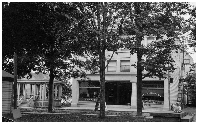
1906 completed Opera House, Bank on left side

More Downsville Bank history in upcoming issues of Colchester History Connections.